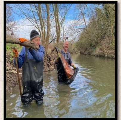
Local volunteers clearing rubbish from the River Roding.