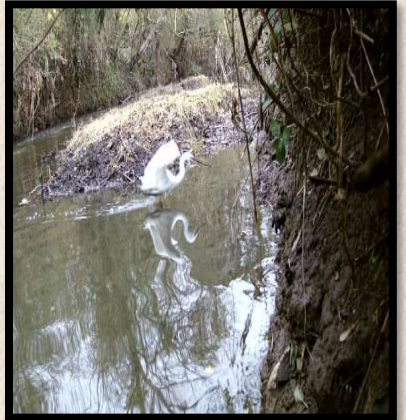
Little egret captured on camera trails installed on areas of improvement