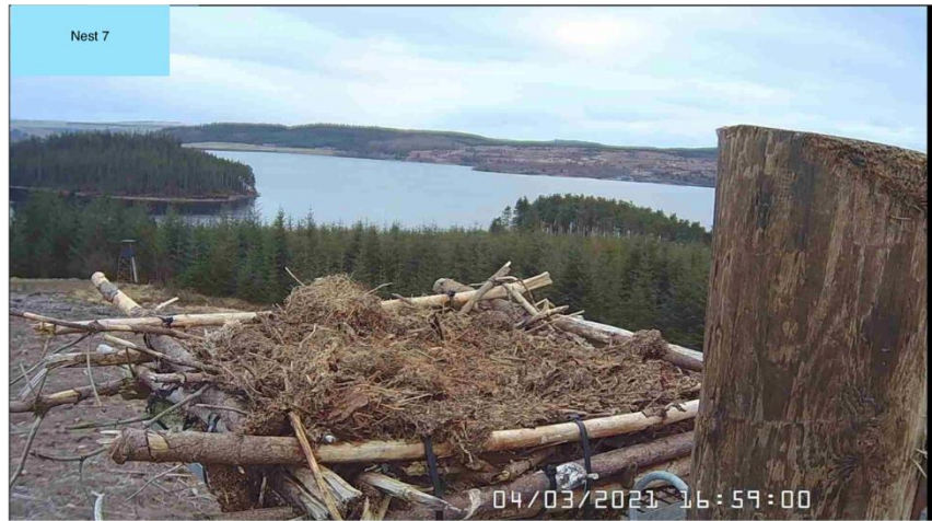
Figure 2: Installation of the new camera and Osprey nest protection at Kielder Water