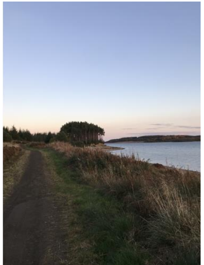
Resurfacing works along the Lakeside Way – two example locations where surface improvements have been carried out