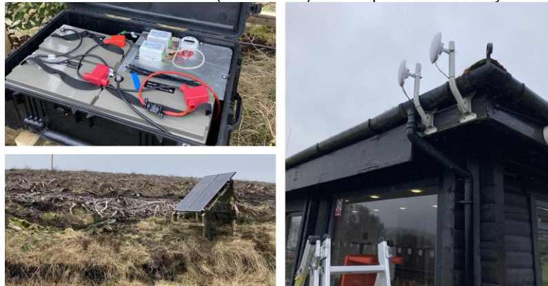
Solar panels, radio mast, control box and receivers for Osprey Watch